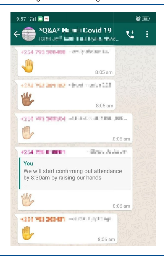
FIGURE 2. Screenshot of the Virtual RollCall Implemented by the International Centre for Reproductive Health in Kenya to Assess if Interviewers Were Present and Following the Remote Training

challenge. How could we ensure that interviewers understood and retained the material they accessed remotely?